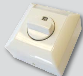
Snowmat is easy to control with a timer or with a control panel.